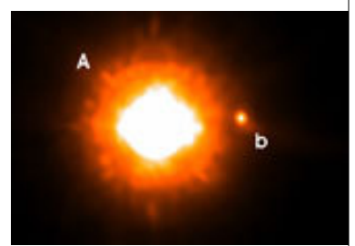
I Dim, cool class M stars make up the bulk of Population II systems. These star systems may only have one or two small rocky planets in orbit. Gas giants are even more rare.

In a globular cluster, there are no young stars. Also, the shortage of heavy metals in Population II areas make the formation of large, terrestrial planets rare and unlucky. The largest Main Sequence star in a Population II region is a G4.